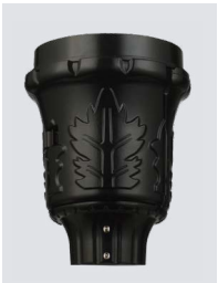
(LS) Utility Leaf